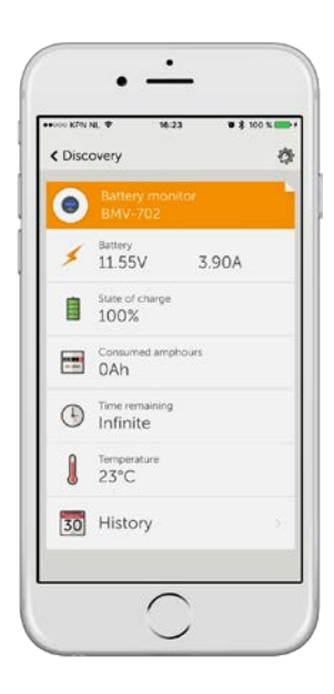
See the VictronConnect BMV app Discovery Sheet for more screenshots