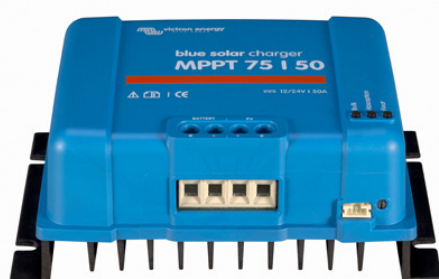
Solar charge controller MPPT 75/50