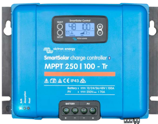
Solar Charge Controller MPPT 250/100-Tr with pluggable display