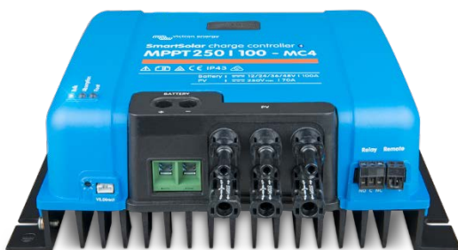
Solar Charge Controller MPPT 250/100-MC4 without display